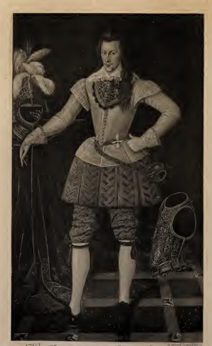
Henry Wriothesley, third Earl of Southampton as a young man from the original picture at Welleck Abbey. Iondon Publiched by Smith First 4 15. Waleslos Flace